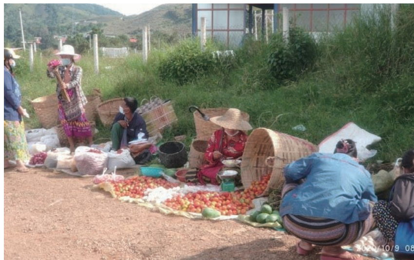
Figure 20. The situation of Market in the covid- 19 period by Sai Lone (TGI)

As Inle Lake is a famous place for tourists and local visitors, the local communities have many chances for occupation and income depends on the tourism. However, during the covid-19 pandemic period, tourism is declined, and the businesses that relied on tourism are failed. The crops and tomatoes are selling at a lower price because of lockdown, registering heavy losses to the economy. When the cultivation business is not enough for daily life, fishing is support for daily income. Fishing is not affected during the COVID-19 period, but income was low due to low fish trade. Five-day markets are also prohibited because of pandemic and cannot be traded between tribes regularly. Even though facing with these difficulties, the Inthar people straggle for daily life by fishing and selling their farm products and handicrafts at Nyaung Shwe and Taunggyi Market. Nonetheless, the ethnic groups in the Inle region are challenging the pandemic and trying to survive by practicing their traditions and customs.