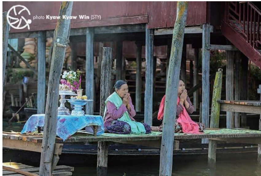
Figure 16. Villagers pay homage to Phaung Daw Oo pagoda during festival by Kyaw Kyaw Win (STY)