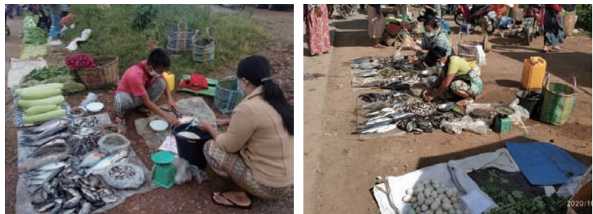
Figure 18. Senses of Marketing the products from Inle Lake (at Taunggyi)

of Inle is tomato production and communities depend on agricultural farming. Fishing is just for daily subsistence. Because of biodiversity and cultural heritages, the Inle Lake is the target of tourists, which supports to the local economy. For the local commercial, the lake-dwellers close links with hill tribes such as Pa Oh, Taungyo and Danu and relate by five-day market cycle around the lake. As five-day markets and floating markets are the major center for exchanging products, important exchange poles and ethnic groups can meet and trade around the Lake.