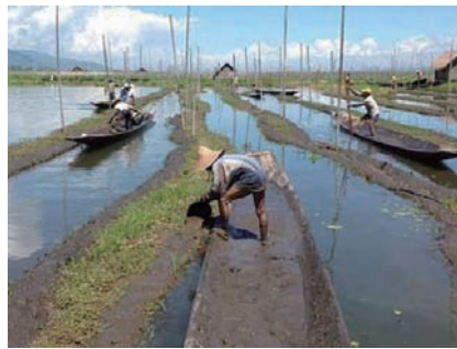
Figure 4. Floating gardens by L Zin Ko (Inlay)

lakebed by bamboo poles on which they can freely slide up and down with the water-level fluctuation. Nowadays, natural floating islands are prohibited by the government in pursuit of sustainable environment. Hence, man-made floating islands are being used.