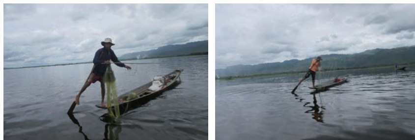
Figure 7. Fishing styles of Inle Lake, photo by Ko Thu Ra (fisherman)

In Inle, the second major livelihood of the Intha people is fishing. Fishing skills with using only one leg of the fisherman a symbol of Inle Lake. The fisherman balances himself on one leg at one end of the small wooden boat and the other leg is wrapped around the oar while rowing the boat. While they row the boat, they can do with their hand trawling, forking, and fishing.