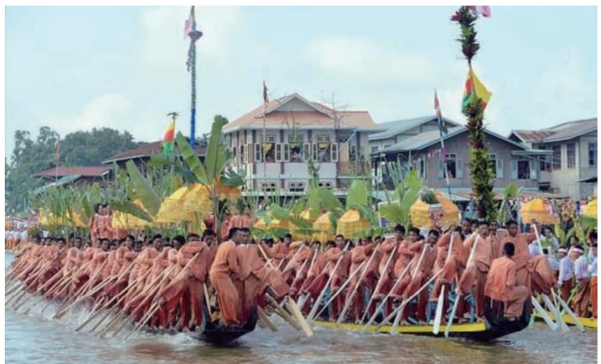
Figure 15. Towing the pagodas barge by hundreds of boat men by Pha Phu Sar (Inlay)