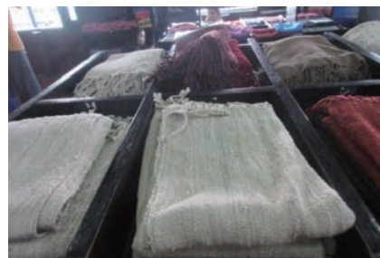
Figure 13. Weaving lotus textile at In Pow Khon Village