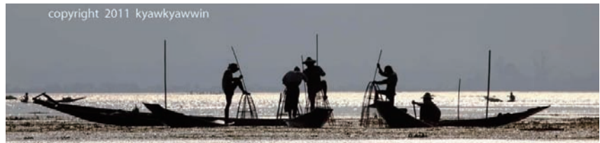
Figure 1. Livelihood of Intha by Kyaw Kyaw Win (STY)

"The region where no road is found on the ground, where only water can be found; the trip is not traveled on carts but by boat, and the boat is not rowed by hand but with leg; and the house is not built on land but on water." This anecdote refers to the Inle Lake.