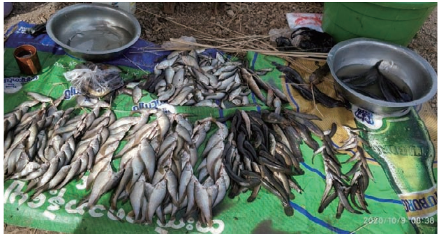
Figure 9. fishes from Inle Lake

According to the mythical ancestry, the whole community is the son of the lake. Therefore, there is no control and no restraint to use on the resources of Lake. For instance, any fisherman can cast his net in any village, in any place of the lake. They don't demarcate the territory for fishing other than in the villages. Most of the Intha people are fishermen as well as agriculturalists. For instance, they go fishing only after the completion of agricultural work.