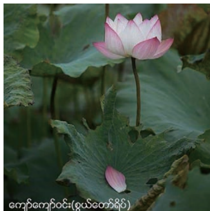
Figure 11. Sacred lotus for weaving workshops

Lotus weaving is an exquisite handicraft and one more symbol of the Inle Lake. The origin of lotus weaving is only for offering to Buddha and monks. Nowadays, lotus textile is woven as splendor product and precious brands. Most of the lotus weavers are women and as can do household. The process of extracting lotus fibers is that two inches of lotus stems are cut with knife and the fibers are extracted and rolled to form the long and fine threads, and then it is immersed into the water to moisturize. The original color of lotus thread is creamy and dyed with the natural dying such as tree barks, seeds, flower petals and fruit and so on. After the extraction process, dying with natural dye and weaving on handloom are carried out. Though the pure lotus textile is expensive, silk mixed with lotus textiles are quite reasonable price. Lotus weaving workshops are attraction for tourists and local visitors.