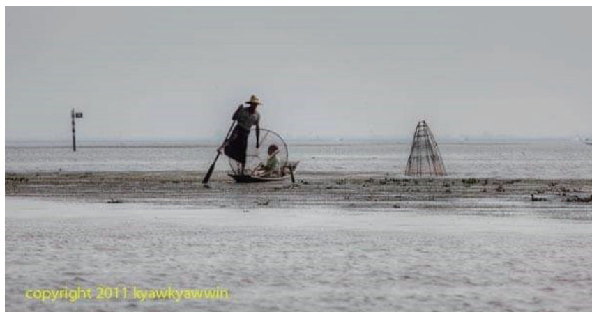
Figure 3. Rowing with one leg by Kyaw Kyaw Win (STY)