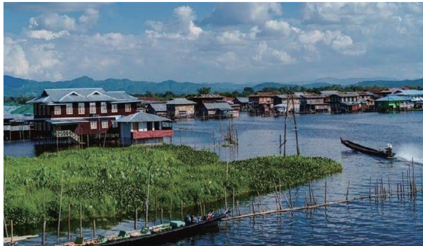
Figure 2. Inle village by Kyaw Kyaw Win (Swealtawyate)