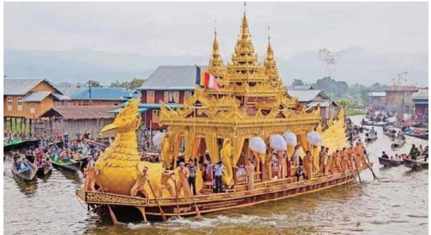
Figure 14. Phaung Daw Oo festival by Kyaw Kyaw Win (STY)

Most of the people of the Inle Lake are Buddhists and the festive events are related with Buddhism. The Phaung Daw Oo pagoda festival is famous among Myanmar Festivals. Four Buddha images are placed on the Royal Karaweik barge which is towed with long boats manned by up to a hundred leg rowers. The Royal barge stops at 21 villages around the Inle lake and the images stay in the main monastery of these villages for one night. The traditional long boat races are the highlight of festival, the rowers standing and rowing with one leg. One of the biggest days of the festival is the day that the Buddha images arrive at Nyaung Shwe where many pilgrims from the whole country gather to celebrate and pay homage. This festival is concerned with other cultural practices of the Inle Lake.