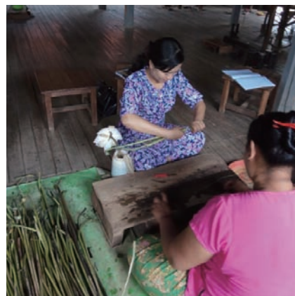
Figure 12. Extracting Lotus fabrics at Ko Than Hlaing Weaving