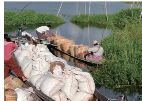
Figure 6. Brokers are buying at the garden by L Zin Ko (Inlay)

Manmade floating islands are made with the grass from the garden, reed, water hyacinths, and old soil removed from the surface of floating island and placed in calm water by systematic line-up and repair for 3 years. These islands are thinner than natural island and mostly cultivated in low-water villages. The lifespan of a floating islands is only about 5 years, and are covered with mud scooped out from the lakebed, a layer of lake-weeds, and more silt for repair and stored for about a year, they can be replanted. Formerly, the farmers saw islands from the shore of Lake and prepared for cultivation themselves, but now they buy the already-prepared island. The floating agriculture is started around the month of July to November. Tomatoes are the main crop on the island. Other crops are beans, cucumbers, gourds as well as flowers sold to ornate domestic altars. For the cultivation the Intha people use only boats throughout the season of cultivation. The cultivated crops are sold directly at the five-day markets, and to brokers at Nyaung Shwe, Taunggyi, and Aung Pan Town.