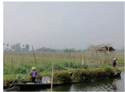
Figure 5. Fertilizing for gardens by L Zin Ko (Inlay)

Manmade floating islands are made with the grass from the garden, reed, water hyacinths, and old soil removed from the surface of floating island and placed in calm water by systematic line-up and repair for 3 years. These islands are thinner than natural island and mostly cultivated in low-water villages. The lifespan of a floating islands is only about 5 years, and are covered with mud scooped out from the lakebed, a layer of lake-weeds, and more silt for repair and stored for about a year, they can be replanted. Formerly, the farmers saw islands from the shore of Lake and prepared for cultivation themselves, but now they buy the already-prepared island. The floating agriculture is started around the month of July to November. Tomatoes are the main crop on the island. Other crops are beans, cucumbers, gourds as well as flowers sold to ornate domestic altars. For the cultivation the Intha people use only boats throughout the season of cultivation. The cultivated crops are sold directly at the five-day markets, and to brokers at Nyaung Shwe, Taunggyi, and Aung Pan Town.