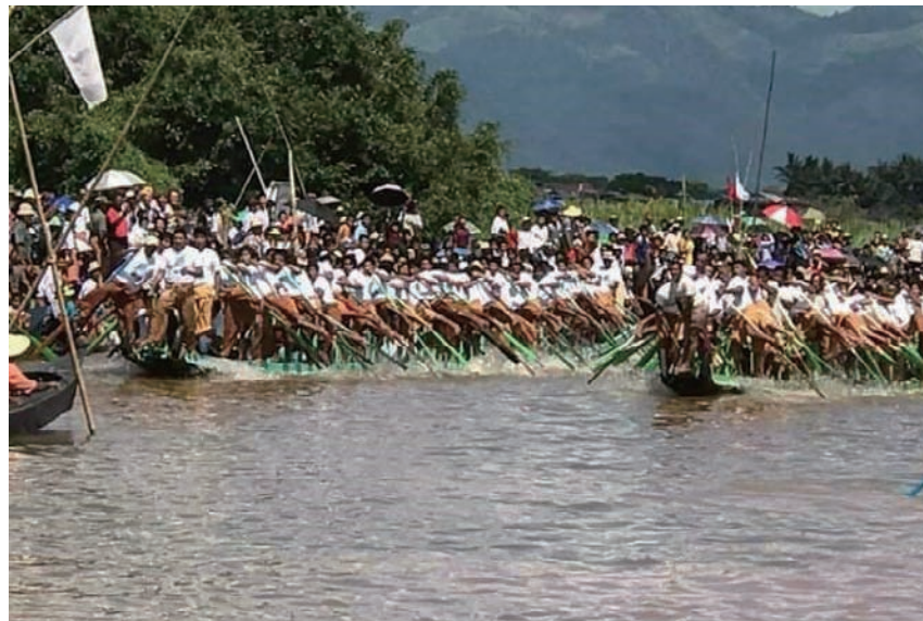
Figure 17. Racing boats during festival by Pha Phu Sar (Inlay)