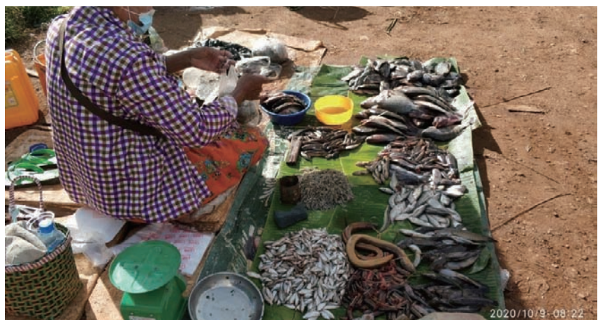
Figure 10. Selling fishes in Market

After keep to consume the fishes at home, most are sold either within the village, buyers who buy fish on the boat or on the five nearby market days or Nyaung Shwe and Taunggyi through brokers. Generally fishing season is from May to November. Traditionally, the fishermen do not fish in the great day of religious, Sabbath days and market days. As the fishing and marketing system, Intha fishermen are not really “commercial fishermen” but income sufficient is only for subsistence.