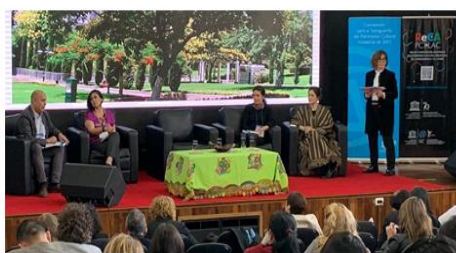
ICH a cross-sectorial development of public policies . Paraguay, 2018