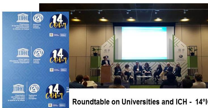
Roundtable on Universities and ICH - 14 th ICH Intergovernmental Committee . Colombia, 2019