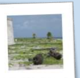
Phoenix Islands, Kiribati