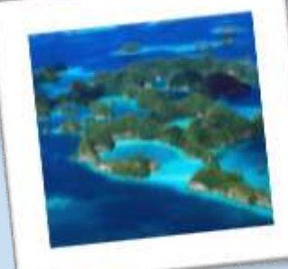
Ngerukewid Islands National Wildlife Preserve