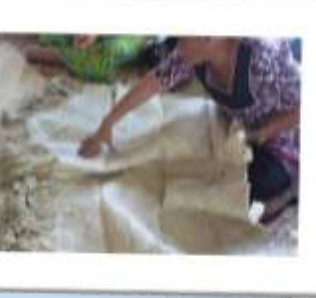
Reflections on Heritage Programme Development at The University of the South Pacific